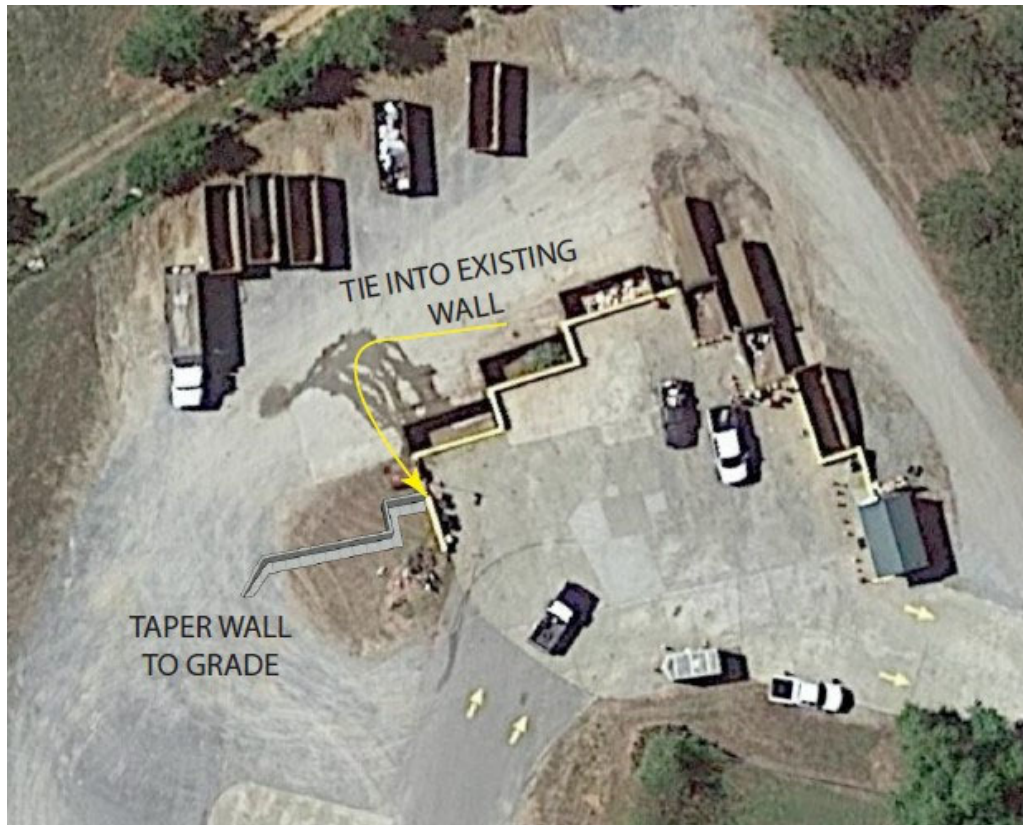
Illustration of the Oak Grove Convenience Center Retaining Wall Concept

The retaining wall shall be tied into the existing retaining wall as illustrated shown below.